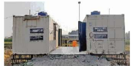
गलगलिया चेकपोस्ट पर बना ग्रामीण स्नेह फाउंडेशन का कैंसर प्रारंभिक जांच एवं परामर्श केंद्र

संवाद सूत्र, टाकुरगंज (बिहार): प्रखंड के गलगलिया चेक पोस्ट पर स्थित ग्रामीण स्नेह फाउंडेशन द्वारा संचालित कैंसर प्रारंभिक जांच एवं परामर्श केंद्र से क्षेत्र के लोग काफी लाभान्वित हो रहे हैं। कैंसर के प्रारंभिक जांच एवं परामर्श केंद्र से देश के सबसे पिछड़े इलाके से कैंसर जैसी जानलेवा बीमारी के प्रति लोगों को जागरूक किया जा रहा है। प्रारंभिक जांच व इसके शेकबाम से संबंधित जानकारी देने के लिए शुरुआत की गई इस संस्थान में कैंसर की निर्यात जांच के अलावा बायोप्सी टेस्ट भी की जा रही है ताकि कैंसर के मरीजों को मुंबई व कोलकाता पर आश्रित नहीं रहना पड़े।