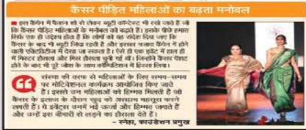
कैंसर पीड़ित महिलाओं का बढ़ता संघर्ष

Madhuri.sengupta@timesgroup.com हौसला मिले तो ताकत मिले। कैंसर पीड़ित महिलाओं की ताकत बढ़ाने के लिए 'हौसला है तो जिंदगी है' नाम का फाउंडेशन बनाया गया है। इस फाउंडेशन के माध्यम से 500 कैंसर पीड़ित महिलाओं को ताकत मिलेगी। कैंसर पीड़ित महिलाओं का बढ़ता संघर्ष कैंसर पीड़ित महिलाओं का संघर्ष बढ़ता जा रहा है। कैंसर पीड़ित महिलाओं का संघर्ष बढ़ता जा रहा है। कैंसर पीड़ित महिलाओं का संघर्ष बढ़ता जा रहा है।